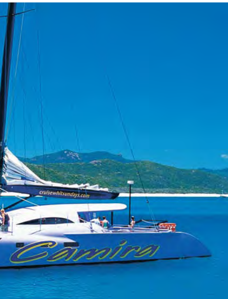
'Camira' - an aboriginal term meaning "of the wind"